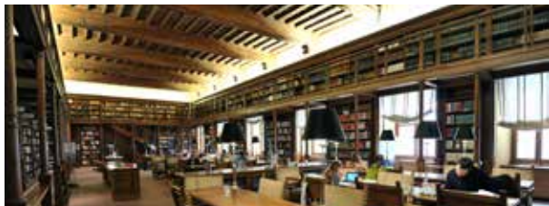
Sala delle Capriate (Truss-roofed Hall)

In 1871, with a collection numbering 22,000 books, the Library was moved to the second floor of Palazzo Montecitorio in Rome, seat of the Chamber of Deputies of the new Kingdom of Italy, where it remained until December 1988, when it was opened to the public and transferred to its present location in the Palace on Via del Seminario , in the complex of buildings making up the ancient Dominican convent of Santa Maria sopra Minerva.