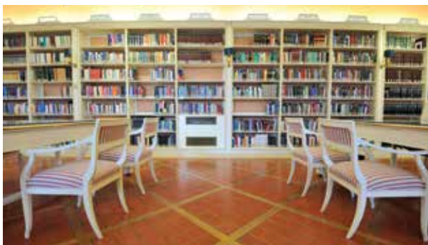
Foreign Legislation Room

It organises periodic bibliographical exhibitions and, in partnership with the other entities involved, arranges visits to the "Insula sapientiae", the complex of buildings making up the Dominican convent of Santa Maria sopra Minerva.